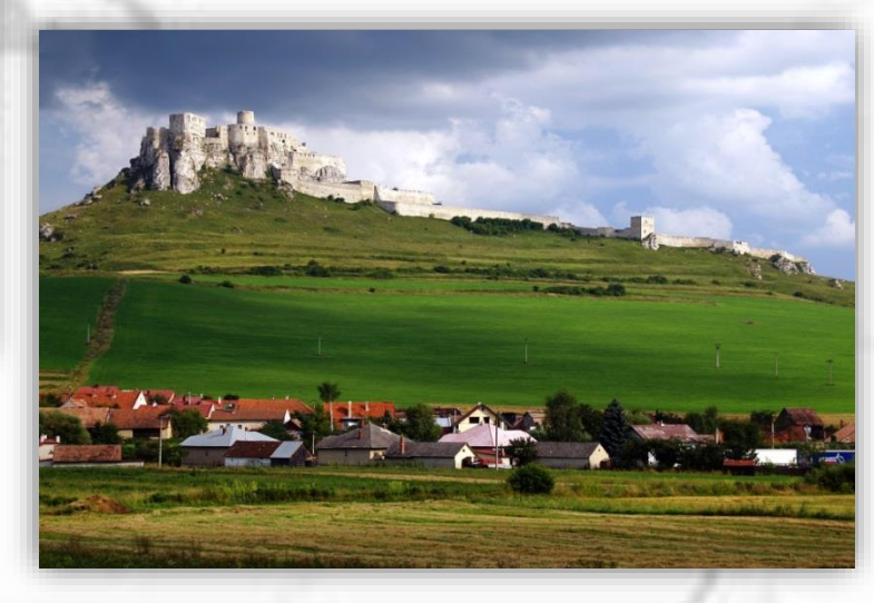
Beauty of SLOVAKIA